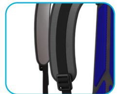
All Day Comfort Adjustable shoulder straps offer comfort and support to the operator.