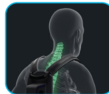
Fatigue Free Use Backpack secured to the waist, maintaining perfect posture.